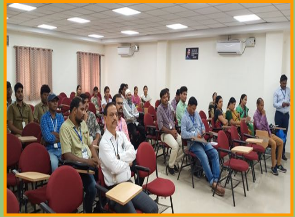
Releasing a souvenir in the inauguration session Faculty listening to the new concepts Of FDP