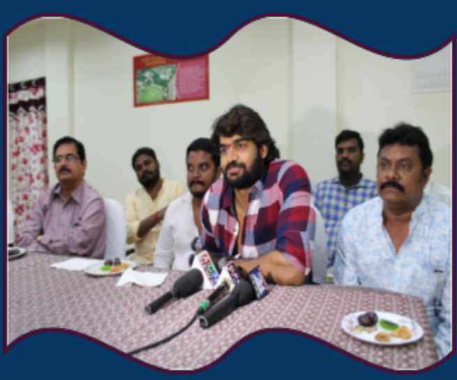
"Guna369" movie hero Karthikeya addressing with media in KSRMCE conference hall