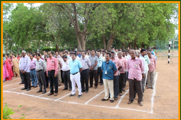
The teaching staff and students gathering before the flag hoisting post on Independence Day