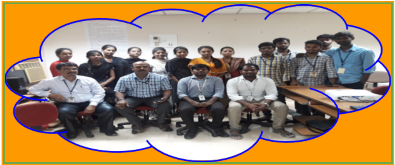
Dean, Coordinator and other staff concerned,CRI with course completed students