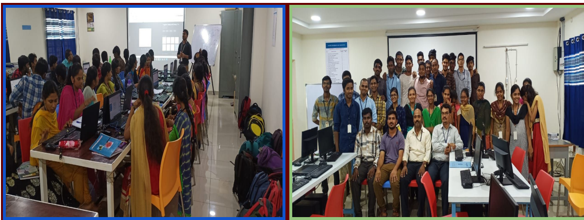
Students at the end of the session with CRI team experts