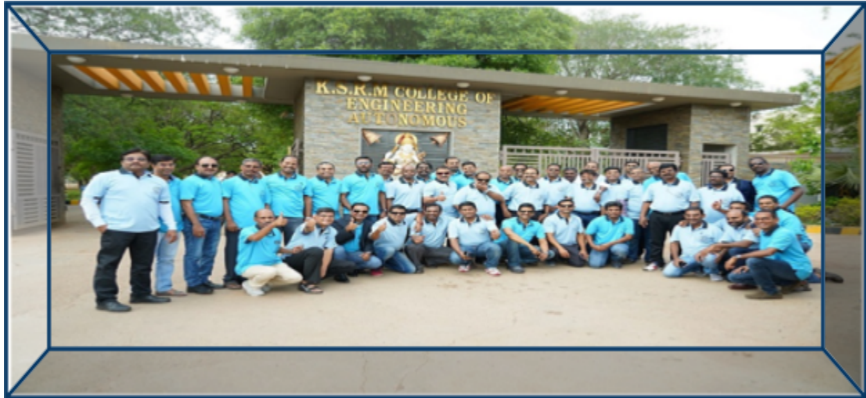
Alumni members posed a snap at the arch way of the college