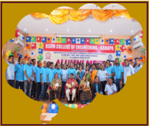
Silver jubilee batch students adoring the faculty members