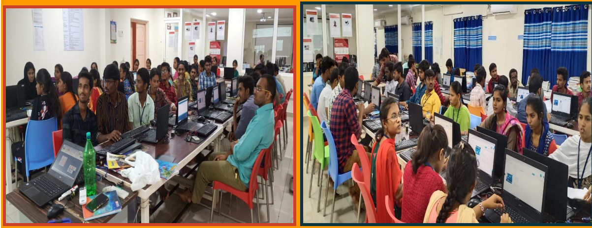
Students listening to the new concepts in the workshop