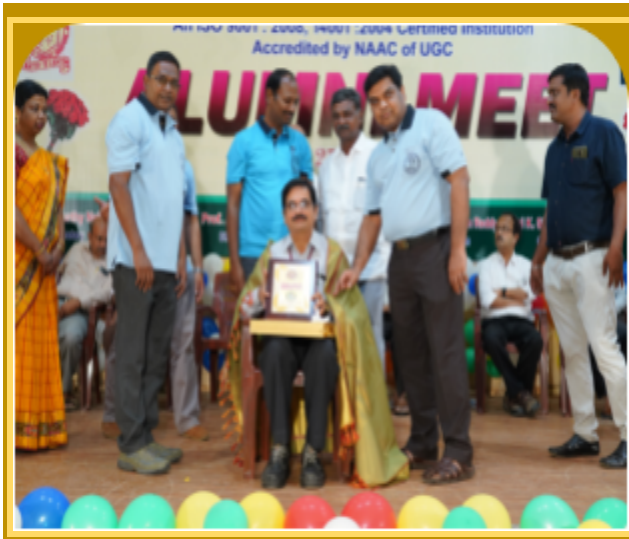
Alumni students honouring the principal with shawl and a memento