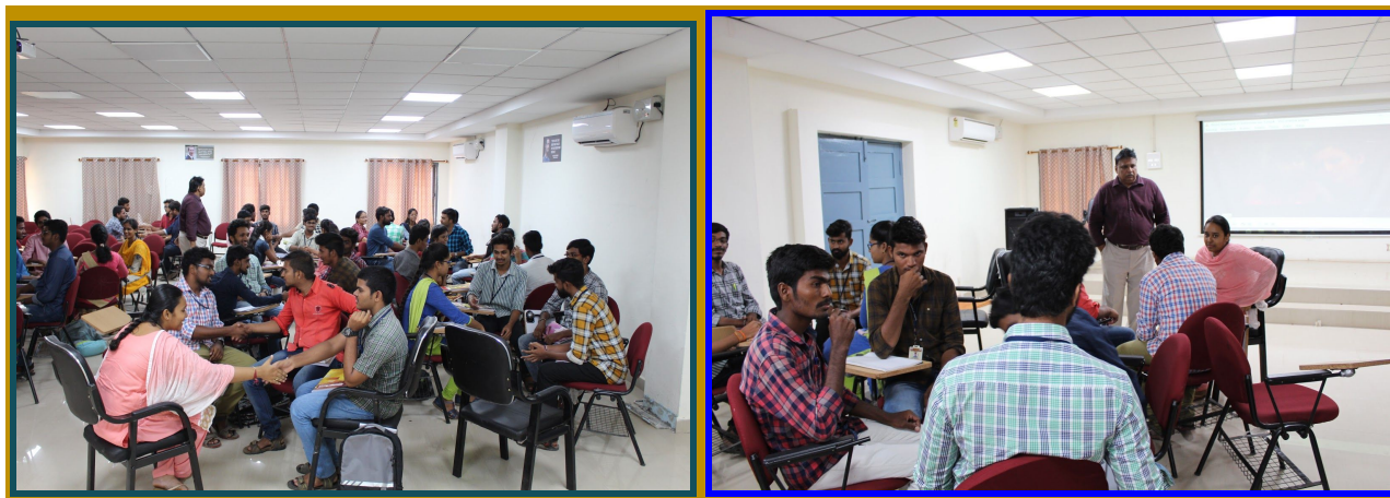
Students engaging group activities in the workshop