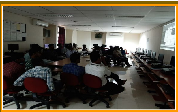
Mechanical Engineering students watching live programme