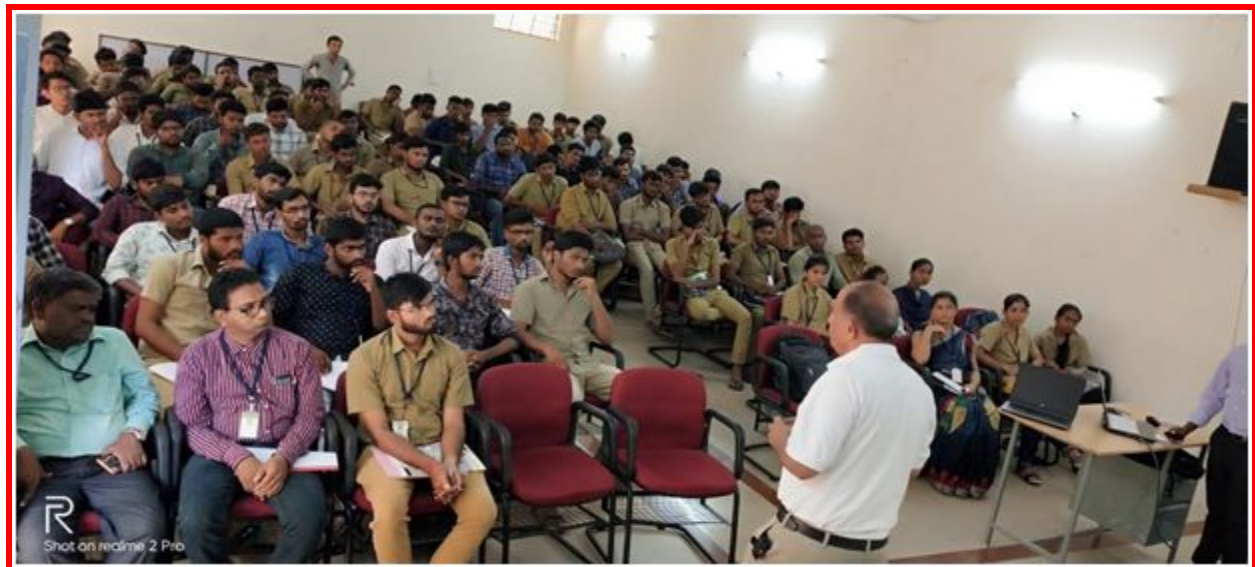
Civil Engineering students and faculty members assembled in the seminar hall